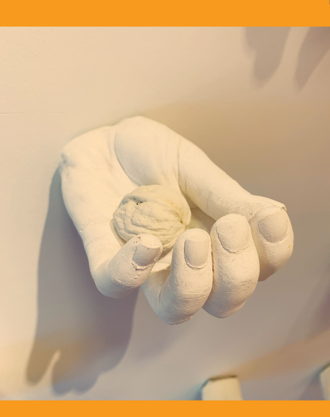
Image Credit: Installation View, VPA Gallery Kelsey Rae Thomas, Confined Pressures , plaster & paper bags, 2021