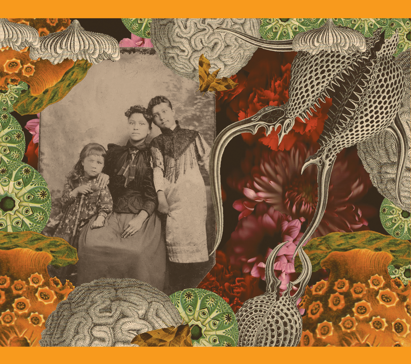
Image Credit: Ashley Vaughan, Our Mothers , archival pigment print, 2020