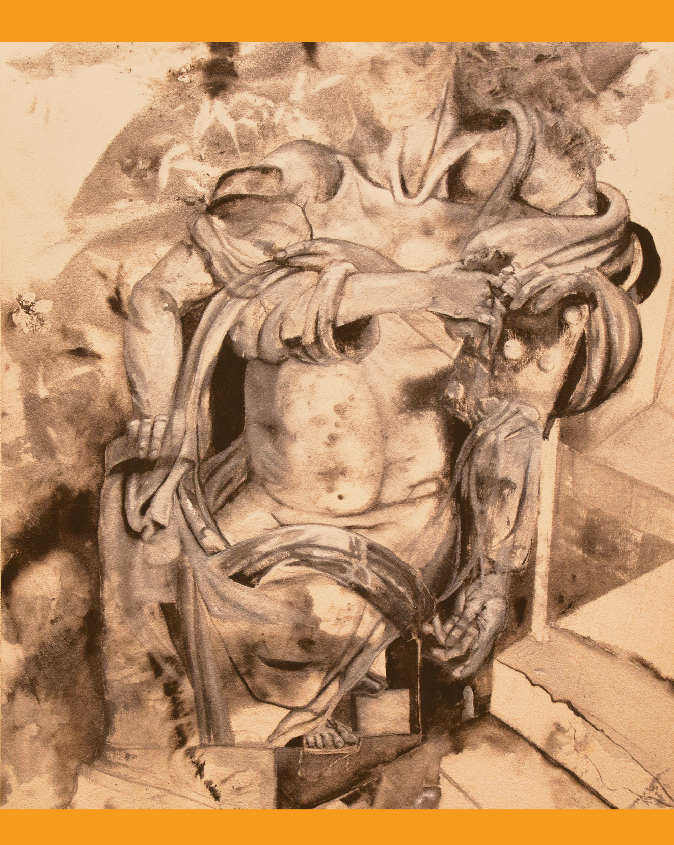
Image Credit: Rachell Hester, Collapsing , mixed media on canvas, 2021