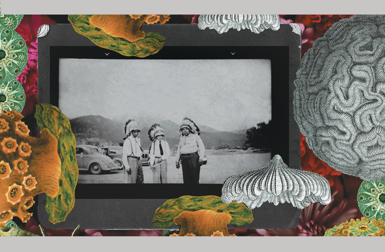
Image Credit: Ashley Vaughan, Our Uncles , archival pigment print, 2020 (detail)

https://www.ashleyvaughanphotography.com