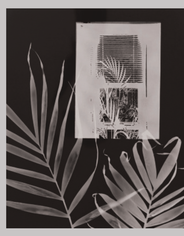
Image Credit: Whitney Aguiñiga, In Contact I & II, Silver Gelatin Print, 2020