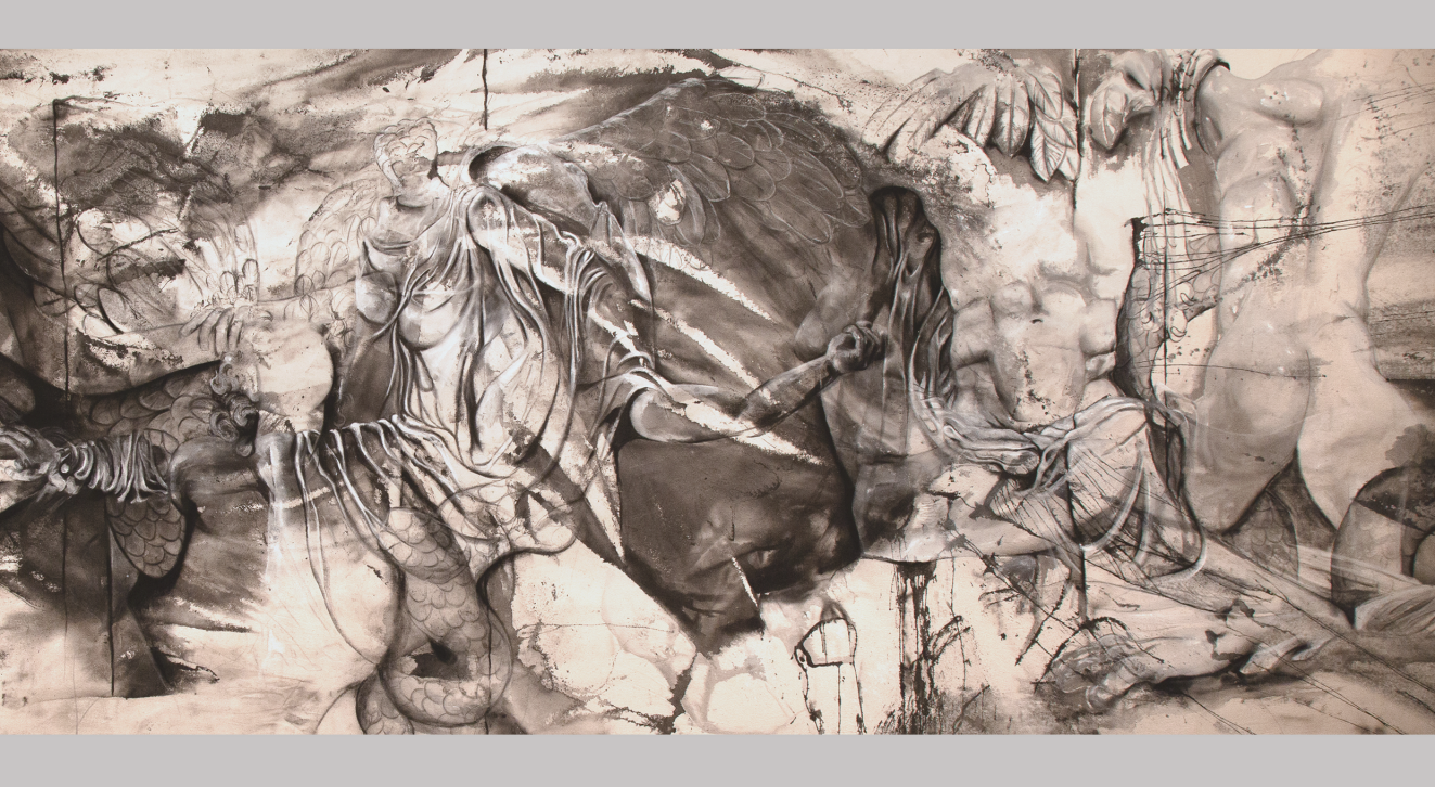
Image Credit: Rachell Hester, Fictions , mixed media on canvas, 2021 (detail)