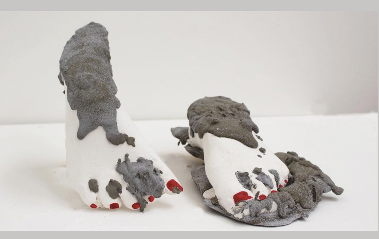
Image Credit: Kelsey Rae Thomas, Stuck in Cement , Plaster, concrete & acrylic, 2021