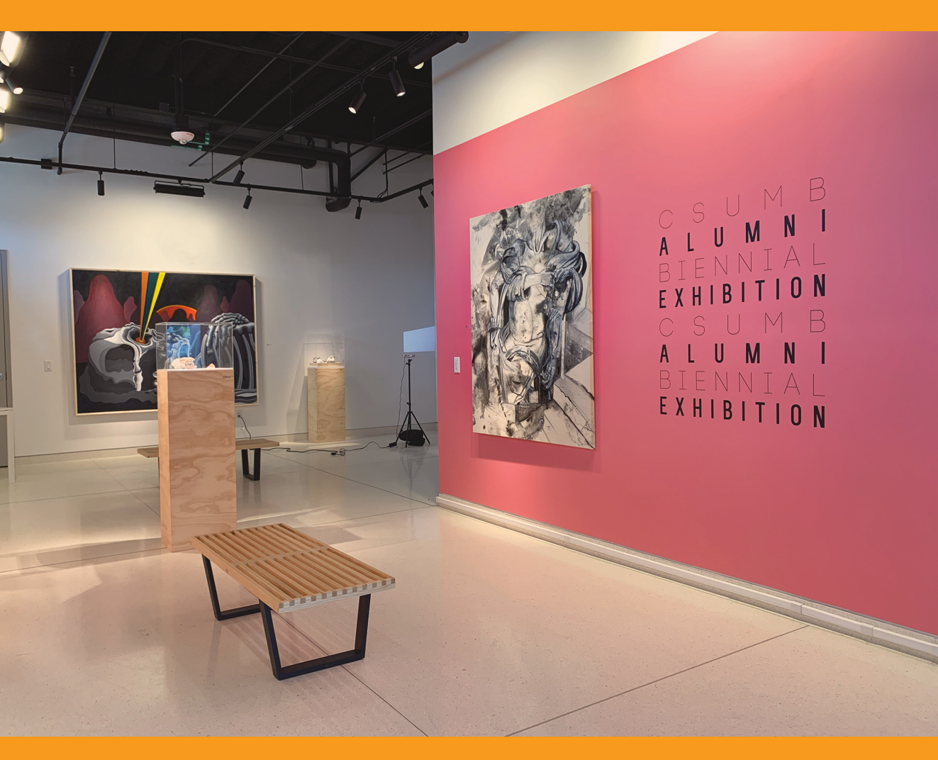
Image Credit: Installation View, VPA Gallery Matthew Floriani, Untitled, acrylic on canvas, 2022 (background) Rachell Hester, Collapsing, mixed media on canvas, 2021 (foreground)