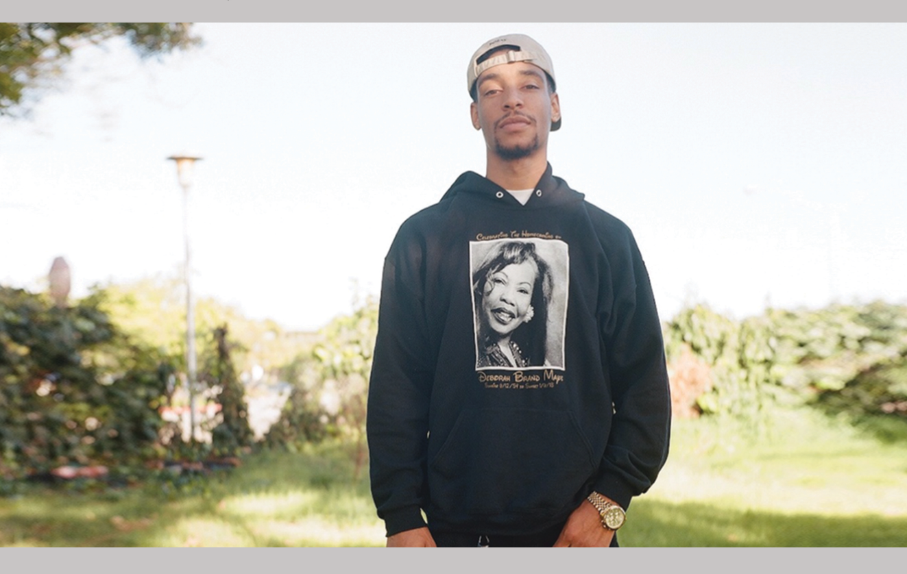
Image Credit: Lauren Finch, Aunt, archival pigment print, 2018 (detail)