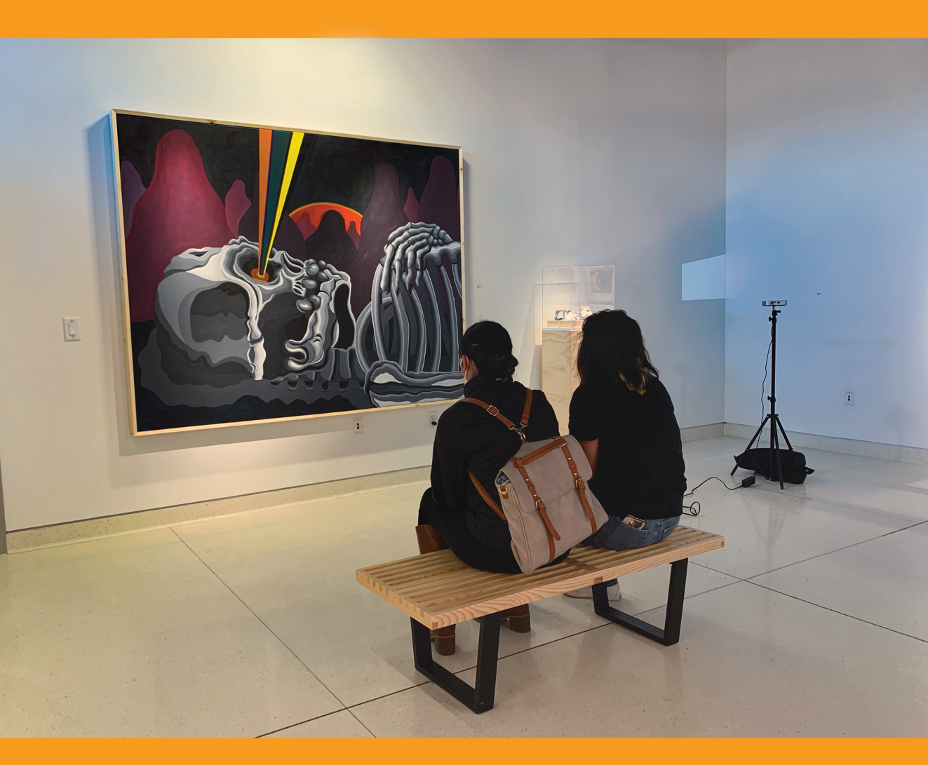
Image Credit: Installation View, VPA Gallery Matthew Floriani, Untitled, acrylic on canvas, 2022