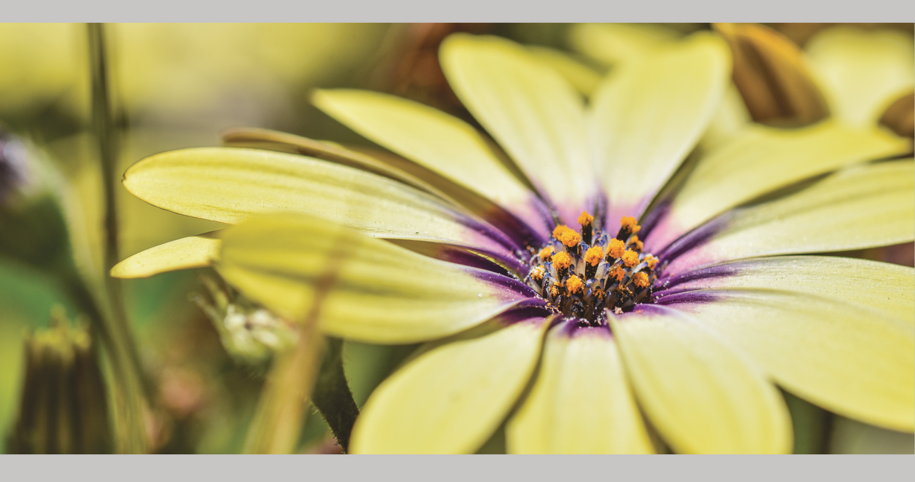
Image Credit: Emerald McColey, Pollination , archival pigment print, 2021 (detail)