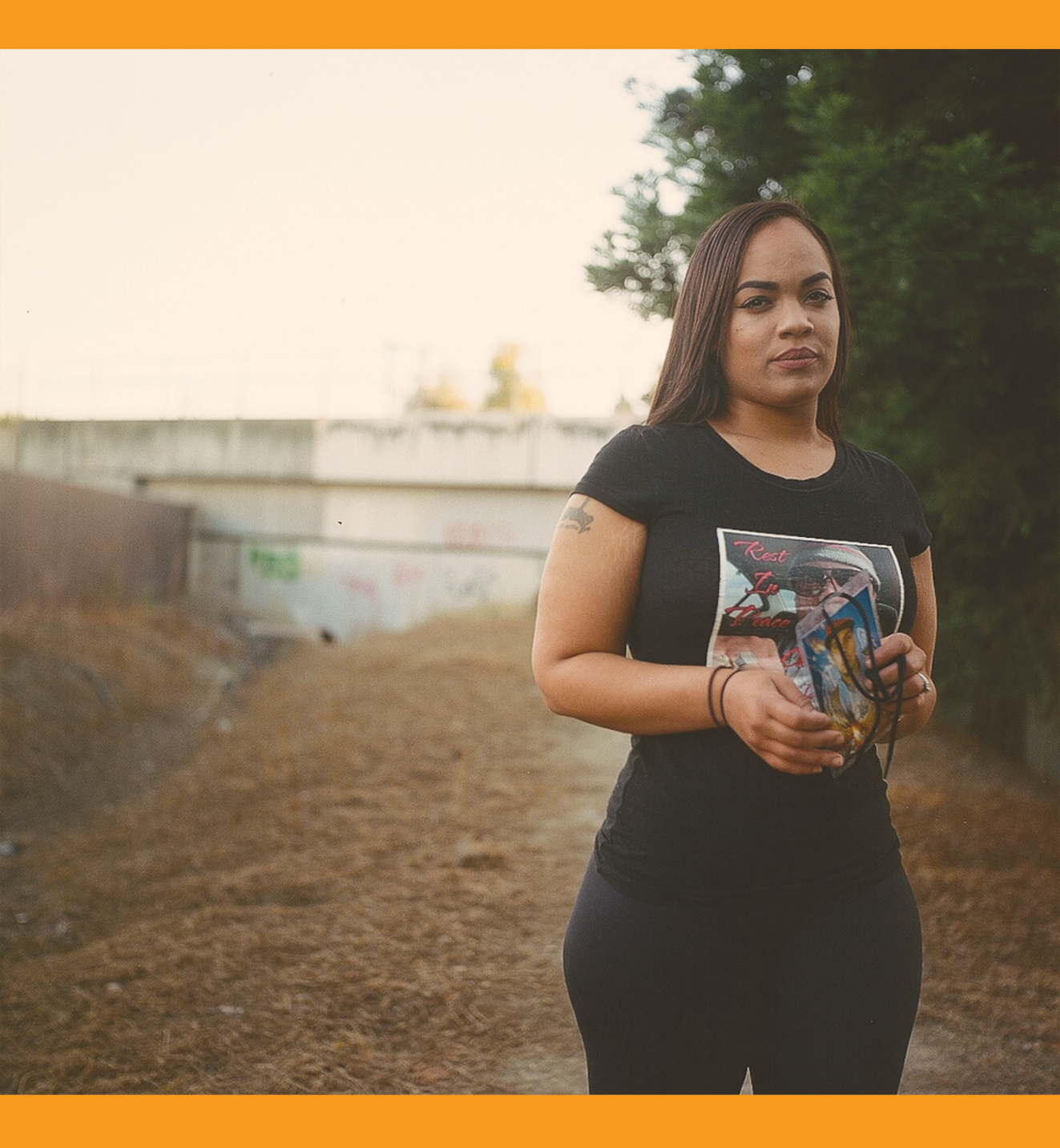
Image Credit: Lauren Finch, Boyfriend , archival pigment print, 2017