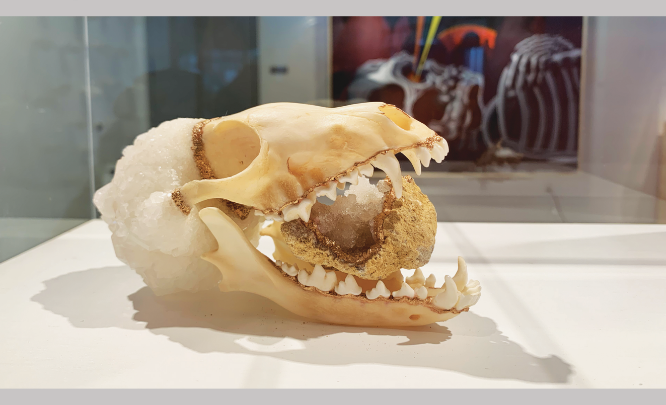
Image Credit: Alison Thomas, Decomposition Crystallization , fox skull, seashell & crystals, 2022